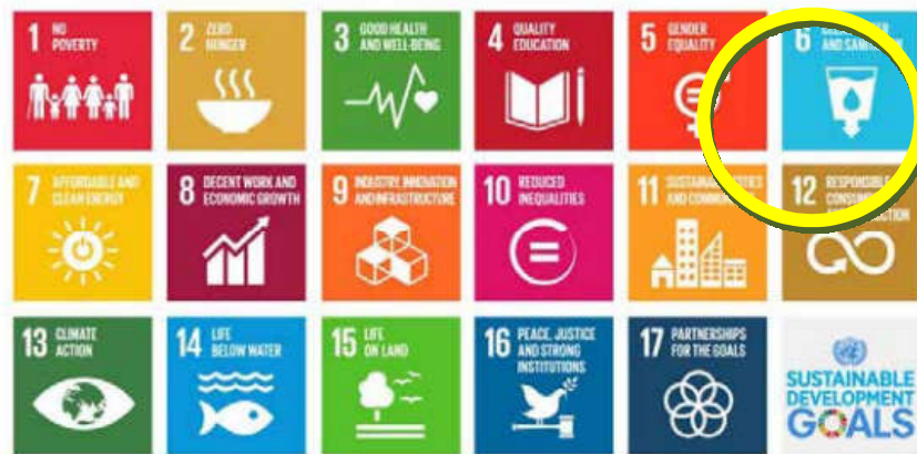
Figure 1: Sustainable Development Goals (SDG)